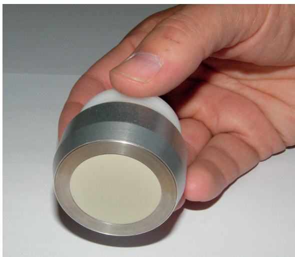
Pressed pellet in pellet holder