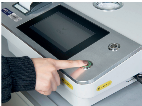
Starting the analysis